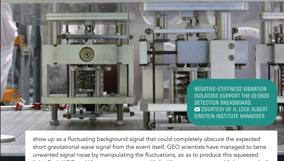
NEGATIVE-STIFFNESS VIBRATION ISOLATORS SUPPORT THE GEO600 DETECTION BREADBOARD.

show up as a fluctuating background signal that could completely obscure the expected short gravitational wave signal from the event itself. GEO scientists have managed to tame unwanted signal noise by manipulating the fluctuations, so as to produce this squeezed light. Both LIGO and Virgo now use squeezed light. Virgo uses a squeezed light source built and operated by GEO, while LIGO uses a squeezed light of its own design.”