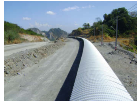
Siam Cement, Thailand