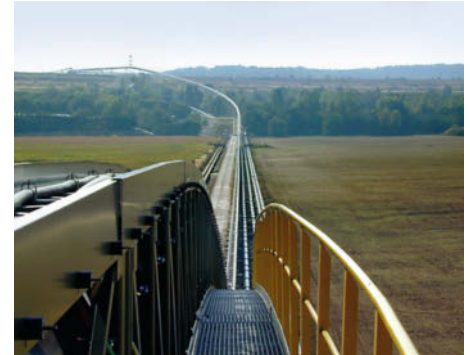
Mělník, Czech Republic