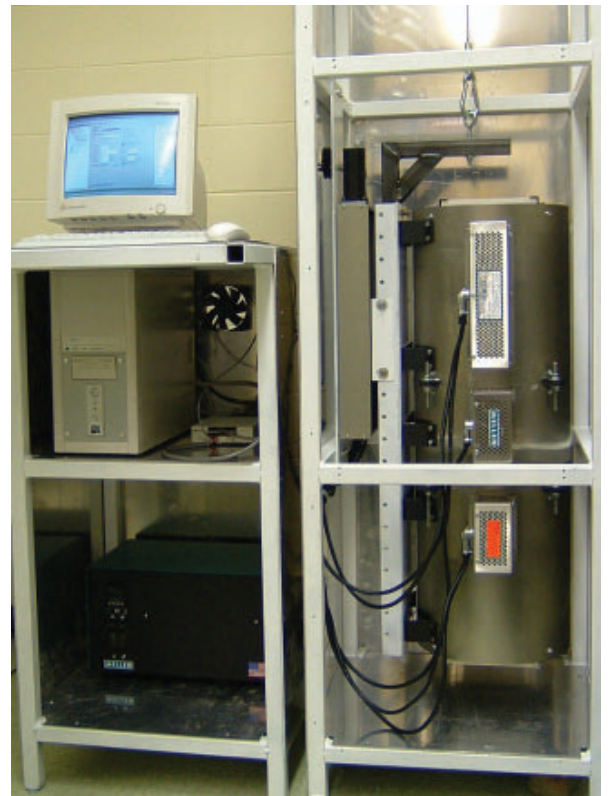
Conventional vertical Bridgman furnace use to grow the semiconductor material cadmium zinc telluride (CZT).

gamma rays from electromagnetic waves to excited electrons. The electrons move through the crystal or create light—one or the other—and produce something that is possible to be detected. If a crystal is very uniform and very homogeneous, it can be determined that a gamma ray interacted in the crystal by the effect that is observed in it.