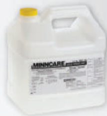
Minnicare Cold Sterilant