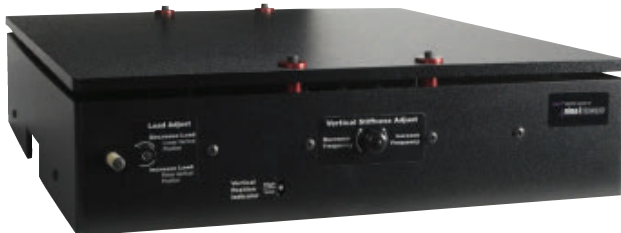
Negative-stiffness vibration isolation platform.

Gamma rays are electromagnetic radiation of high frequency (very short wavelength) that are produced by sub-atomic particle interactions such as electron-positron annihilation, radioactive decay, fusion, and fission. Gamma radiation is highly penetrating photons, extremely energetic. To directly detect them is very difficult—a material with a high-Z number is needed, representing a high number of neutrons and protons in the nucleus. Those nuclei tend to stop gamma rays much better than other elements such as hydrogen or helium, for example. A crystal with a high-Z number converts the