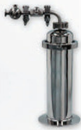
Mini Dry Fog System