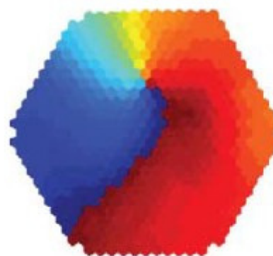
FIGURE 1. Tangential slices of rat occipital cortex, stained with NK3630 dye, change color (absorption) as the transmembrane potential of the neurons varies. Imaging was performed by a 464-element photodiode array at a rate of 1600 frames /s. The oscillations (4–12 Hz) were induced by perfusing slices with 100 mM carbachol and 10 mM bicuculline. The optical signal on each optical detector is a summation of depolarization/hyperpolarization of about 1000 neurons. The optical signal of the oscillations was about 0.01% of the resting light intensity. The signal on each detector is normalized to its own max-min and assigned to a color according to a linear color scale. The oscillations were organized spatially as propagating waves. Wave patterns shown in the movies (see bioopticsworld.com/articles/370602 ) were formed spontaneously.