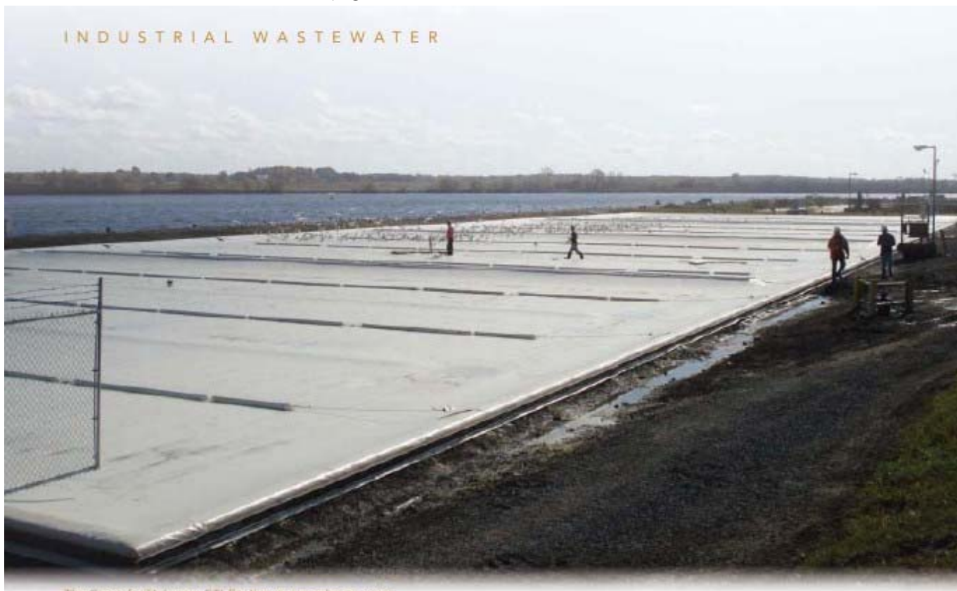
The Casco facility's new GTI floating geomembrane cover

The Casco plant has used a geomembrane cover on its BVF bioreactor since it became operational. In 2008, Casco upgraded to an improved-design floating, insulated geomembrane cover with a streamlined capability to collect biogas. The cover captures all of the biogas from the BVF treatment process. Without a cover, the biogas would be released to the atmosphere. Designed and built by Geomembrane Technologies Inc. (GTI), this new cover is collecting an average of 236,000 cubic feet per day of biogas from the bioreactor at a 65% methane concentration.